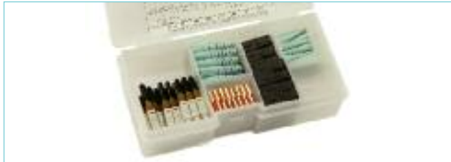
UniCam Connector Organizer Pack (multimode SC connectors shown) | Photo LAN809