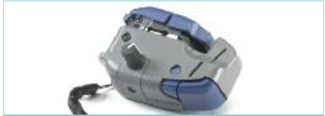
Pretium Cleaver | Photo LAN805