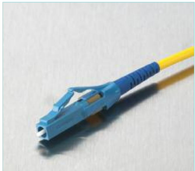
UniCam Pretium-Performance LC Single-Mode Connector | Photo LAN625