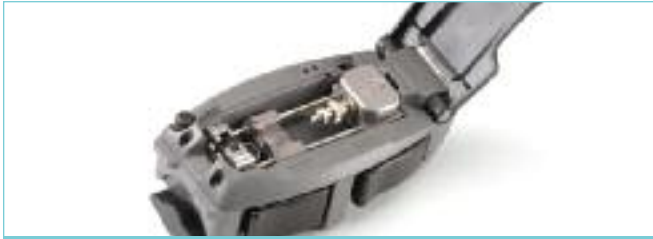
UniCam® Pretium® Installation Tool | Photo LAN770