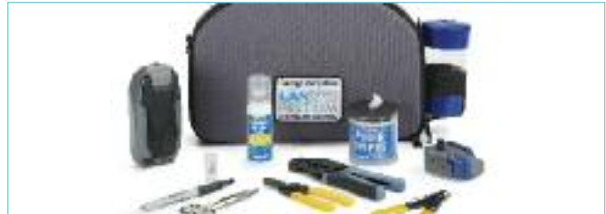
UniCam Pretium Tool Kit | Photo LAN769